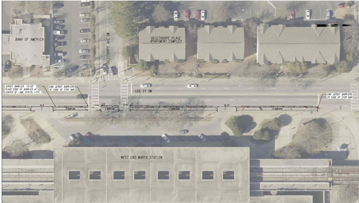
Overhead view of proposed bike lane