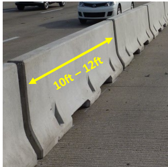
Concrete barrier and dimensions