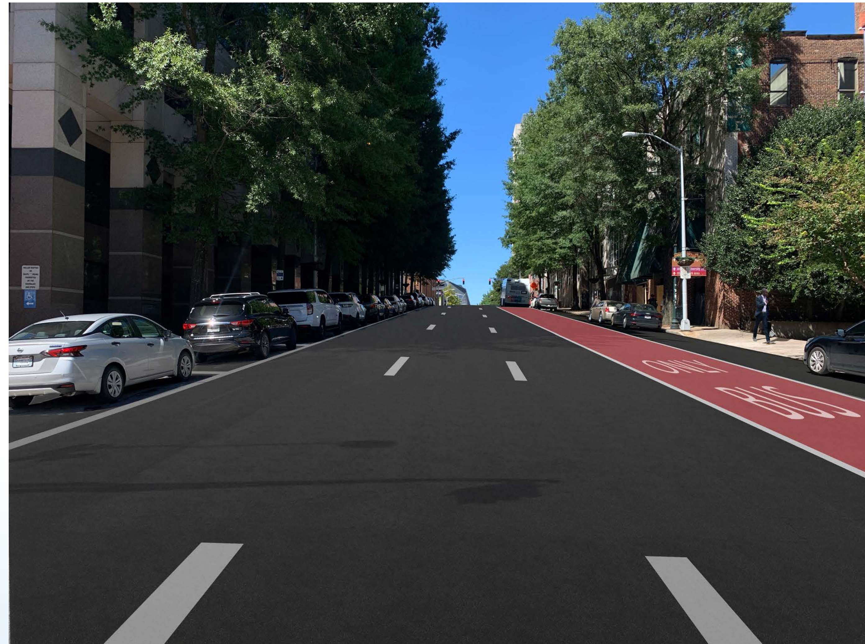
Downtown: Martin Luther King Jr. Drive between Pryor Street and Peachtree Street (looking northwest)