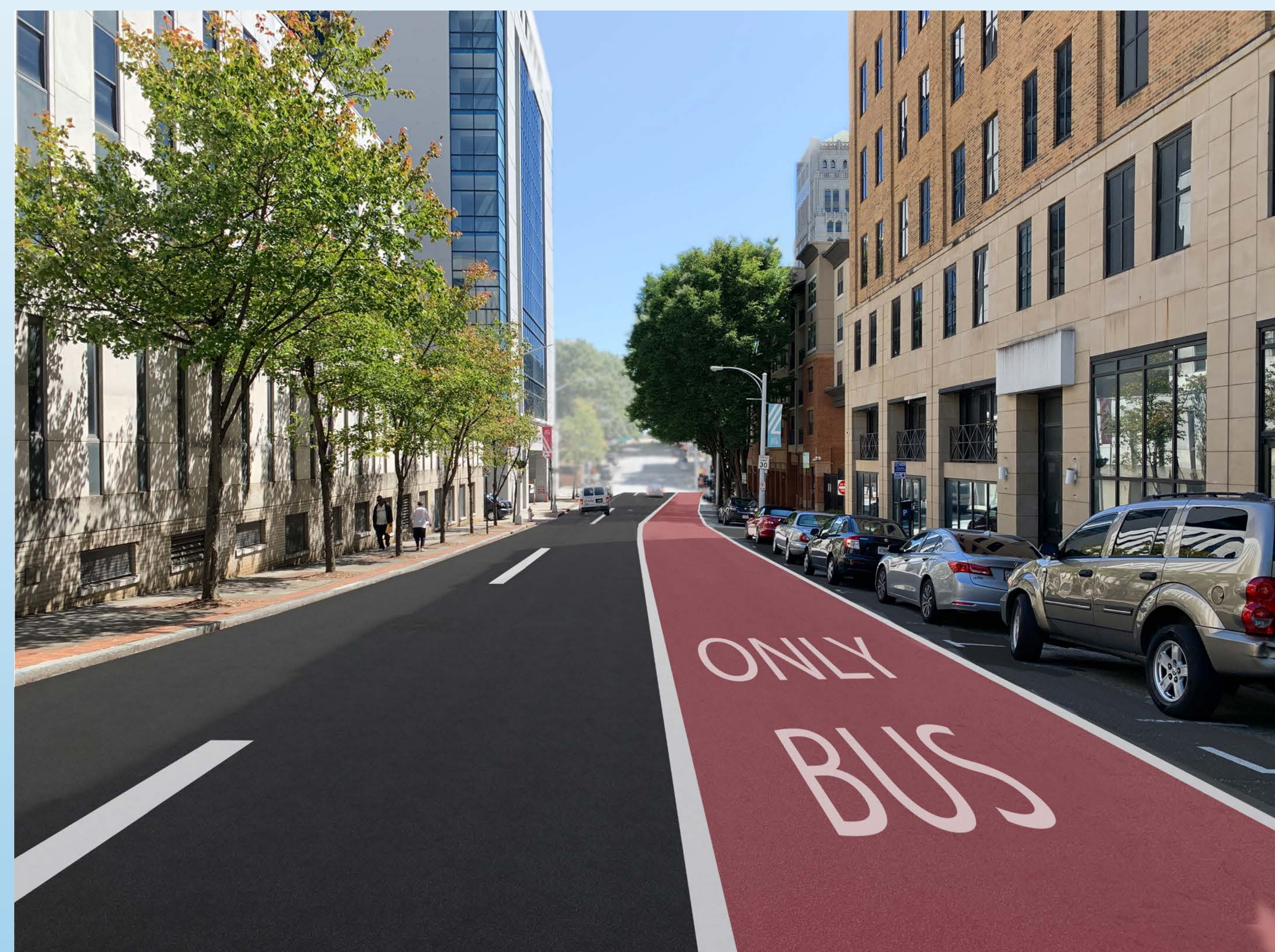
Downtown: Mitchell Street between Pryor Street and Central Avenue (looking southeast)