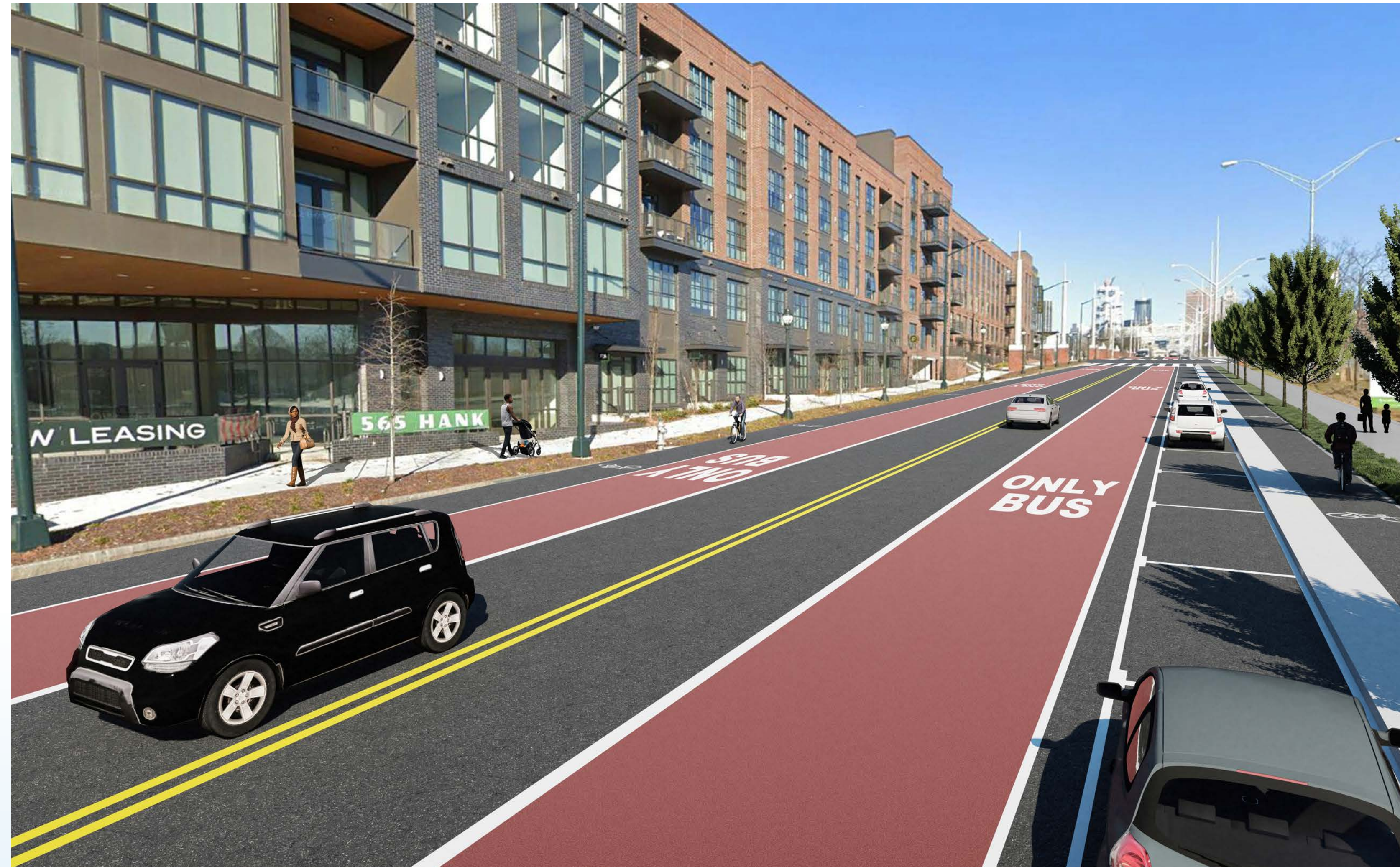
Summerhill: Hank Aaron Drive between Georgia Avenue and Fulton Street (looking north)