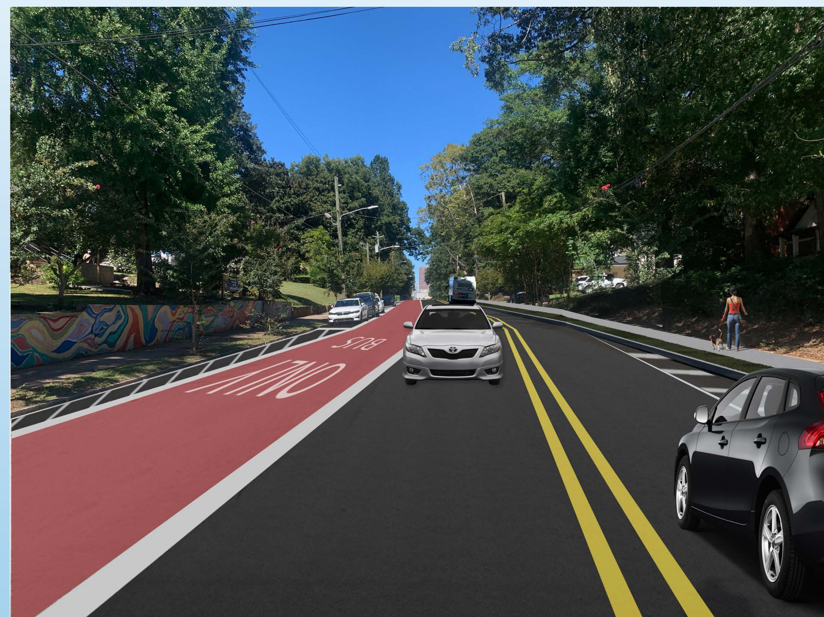
Peoplestown: Hank Aaron Drive between Haygood Avenue and Atlanta Avenue (looking north)