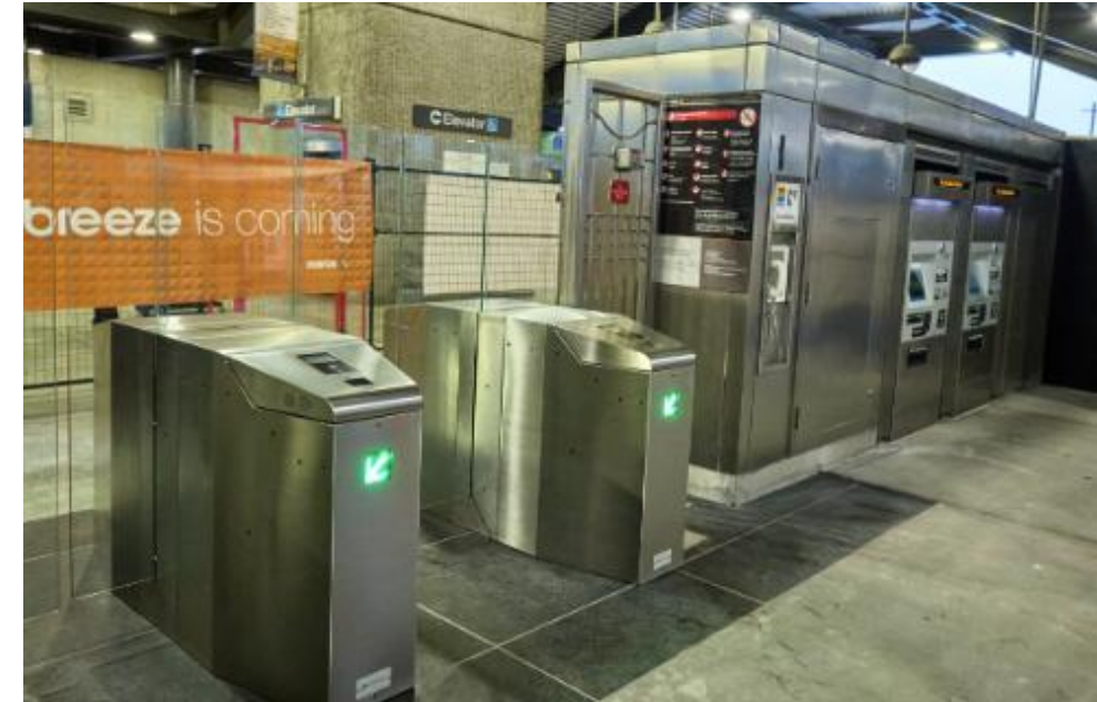
Lindbergh Station SE